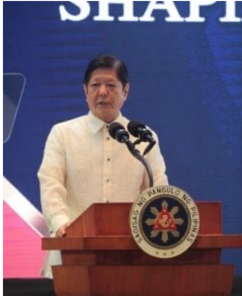
President Marcos Jr of the Philippines speaking at the Seafarer 2050 summit in Manila, June 2023