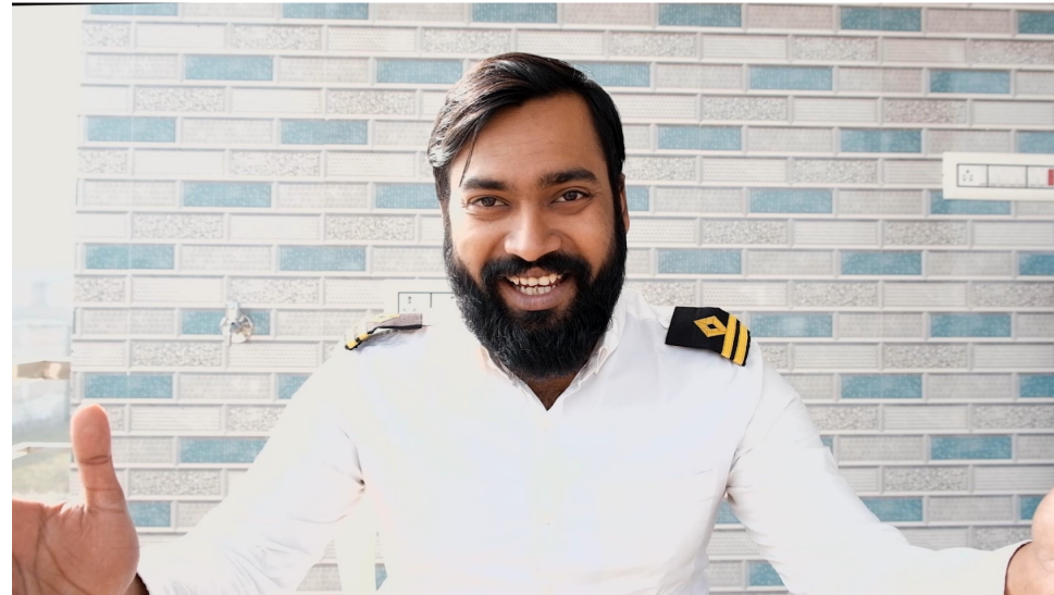
Still from 'An Adventurous Spirit' seafarer recruitment campaign video.